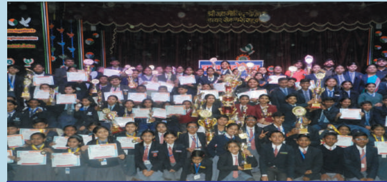
विभिन्न विद्यालयों के पुरस्कृत छात्र-छात्राएँ