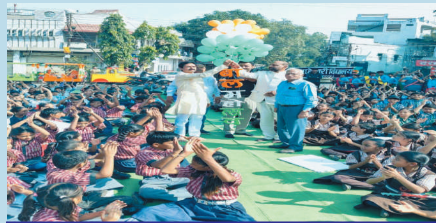
अतिथियों द्वारा बाल महोत्सव का शुभारंभ

भारत के प्रथम प्रधानमंत्री पंडित जवाहर लाल नेहरू बच्चों से बेहद प्रेम करते थे और इसी कारण उनका जन्मदिन 14 नवंबर पूरे देश में बाल दिवस के रूप में मनाया जाता है। प्रतिवर्ष की भांति इस वर्ष भी इस अवसर पर बाल महोत्सव समिति, महू के द्वारा बाल महोत्सव का आयोजन किया गया। "वसुधैव कुटुम्बकम् एवं भारतीय संविधान" पर केंद्रित 44वें बाल महोत्सव में विविध सांस्कृतिक एवं रचनात्मक प्रतियोगिताओं का आयोजन किया गया जिसमें महू नगर एवं आसपास के क्षेत्रों के लगभग 40 शासकीय एवं अशासकीय विद्यालयों के छात्र-छात्राओं ने भाग लिया।