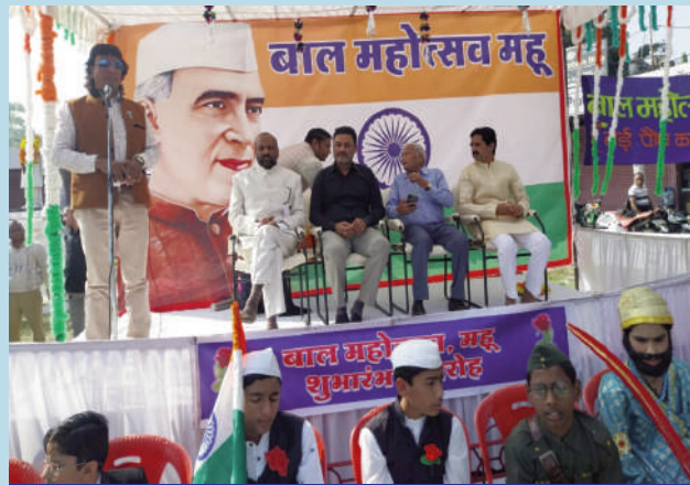
उदघाटन समारोह में मंचासीन अतिथिगण