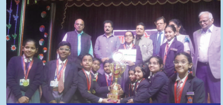
आकर्षक पुरस्कारों से पुरस्कृत छात्र-छात्राएँ